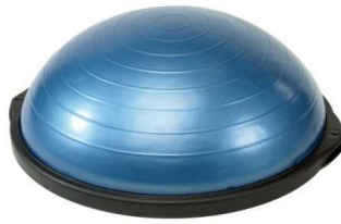
BOSU Rocker board